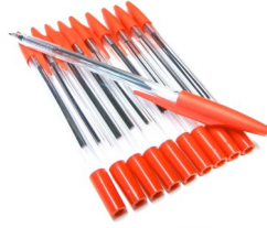
NO red pens or biros