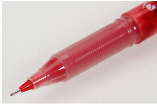
NO gel pens