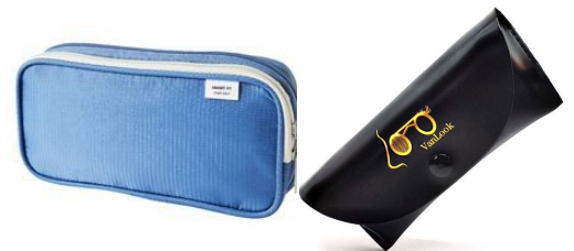
NO pencil or spectacle cases that are not transparent.