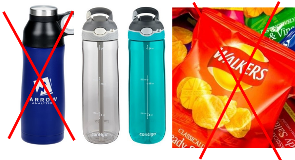
NO bottles unless they are clear with no label and contain still water. NO food of any kind, unless for medical purposes. A permission slip must be carried. Packaging will be checked by an invigilator.