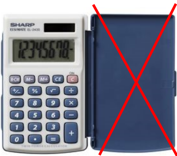
NO calculator cases, lids, covers, operating instructions, stored programs or formulae.