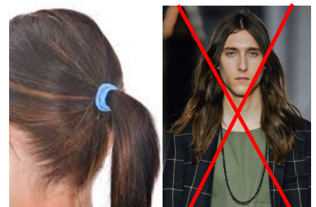
Long hair MUST BE tied back.