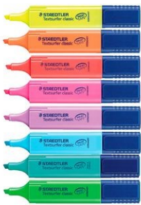
NO highlighter pens