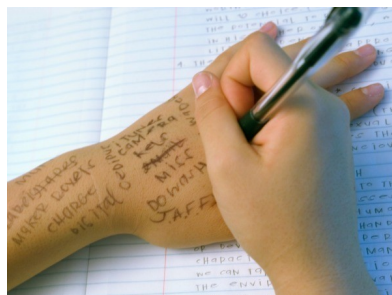
Any writing / marks / symbols MUST BE REMOVED from skin before entering the examination room.