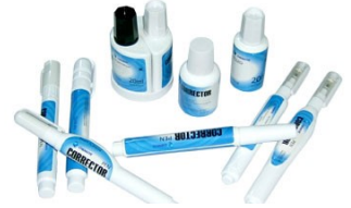
NO correction fluid, tape or pens