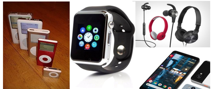
NO Electronic devices, such as mobile phones, iPods, earphones and headphones or smart watches. Earphones will be provided by the school if required.