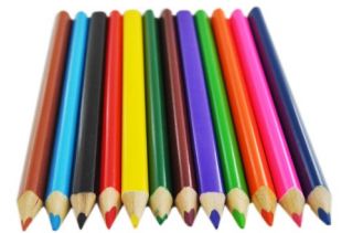
A selection of coloured pencils