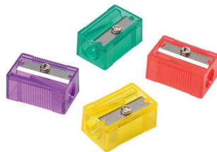
A pencil sharpener