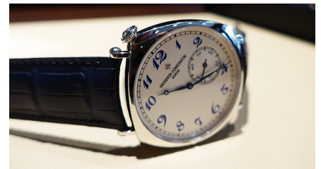
If a wrist watch is worn, it must be placed on the desk in front of you.