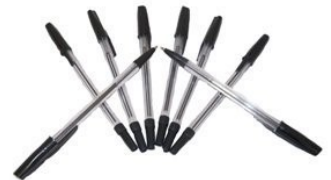
BLACK ink ballpoint pens or biros. No other colour