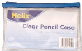
A clear plastic zip-lock bag or clear pencil case