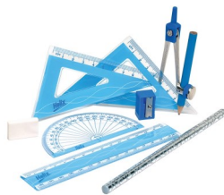
A Maths set – protractor, set square and compass.