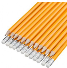
A selection of HB pencils—at least 2