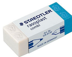
A pencil eraser